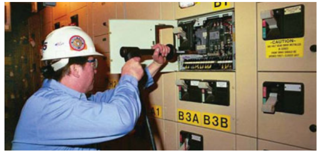
MCCB testing using the HCP2000