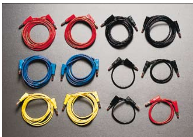
Test lead set GA-00032.