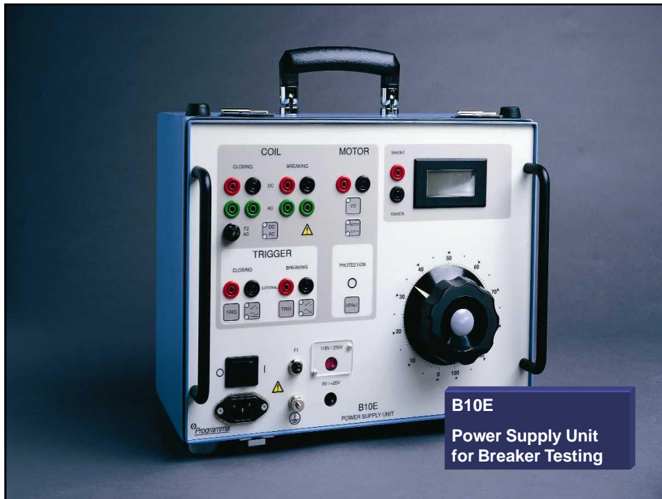
B10E Power Supply Unit for Breaker Testing